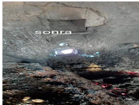
Figure 6. around of the tap hole cleaned by new cleaning equipment