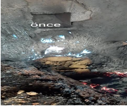
Figure 2. Scals around the tap hole

tap hole can not cleaned properly by cleaning equipment. As the cleaning process cannot be done properly, production losses due to tap hole occur. Scals may accumulate around the spill hole when cleaning is not performed properly and this situation shown in Figure 2. Scals accumulated around the tap hole leads to production losses.