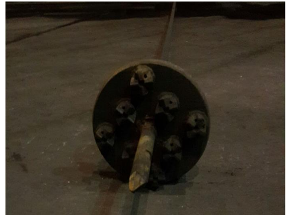
Figure 5: New Cleaning Equipment

Instead of the rod-shaped cleaning bits used in the old type (Figure 3 old-style tip technical drawing), 8 WC drill bits (Figure 4) are used as consumables used in the furnaces in casting opening process. These drill bits are less susceptible to rupture and rapid wear problems with older drill bits. The problem of axial misalignment in the center of the cleaning equipment is also prevented from slipping out of the center by extending the length of the drill bit used in the center and inserting it into the tap hole. (Due to the misalignment in the center, the problem of not being able to close the casting is eliminated.)