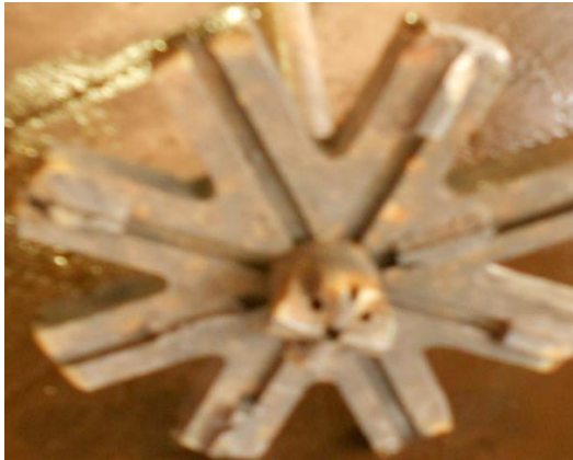
Figure 3. Old Type Cleaning Equipment